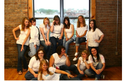
Young Emerging Writer Interns 2011

Join the Young Emerging Writer Interns at the launch party for their magazine, The Atlas . After six weeks and over 40 hours of work, they look forward to showing you their collection of work, representative of the interns' best writing.